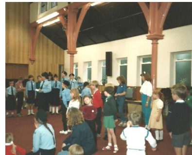
Campaigners but what's the year?

friend, performing in our 'Rock Solid's Got Talent Show'. He certainly brought the house down!