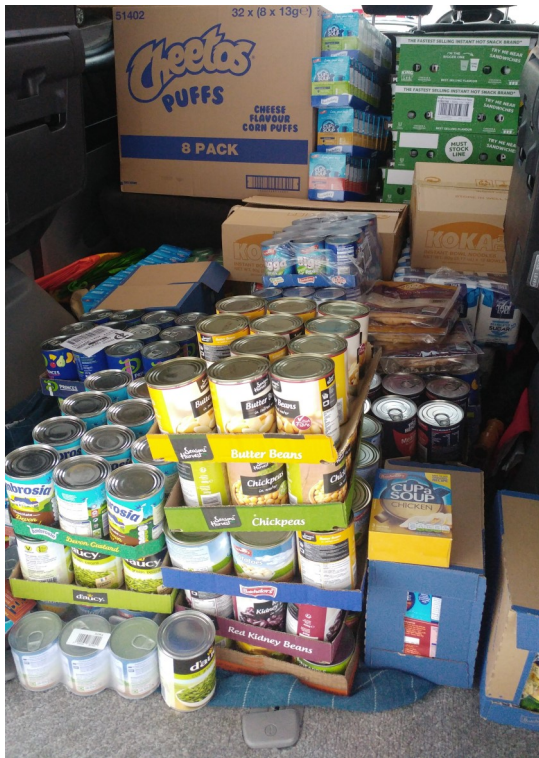
Just a small proportion of what will be provided with B & Ms' grant